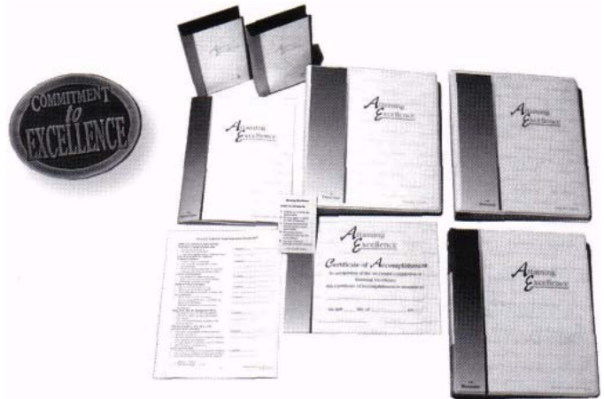
A complete customer service quality program

The Attaining Excellence system includes evaluation forms for use by supervisors to make quality service part of your ongoing performance reviews. They tie your performance reviews to the training, coaching, and quality standards — all in the language of Attaining Excellence .